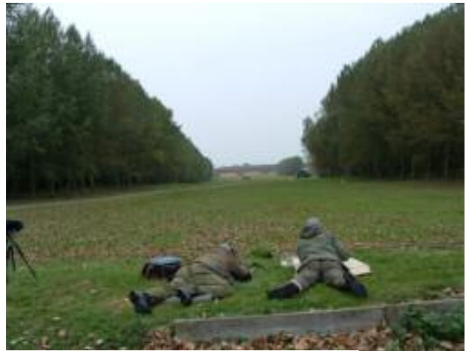
1000 yds in September 2004

You will need to know your muzzle velocity so that your drops can be calculated. Please arrange for this to be done at the Barracks prior to shooting. Several members have chronographs that you can borrow.