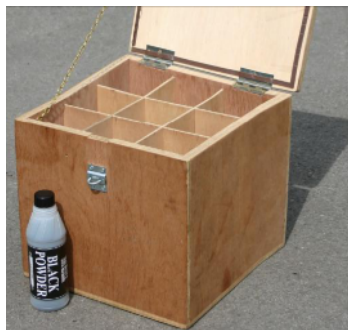
Figure 1 – Example of a Black Powder Storage Box and 550g plastic container

Available from Peter Starley (0845 2266005) or Fenland Rural Sports (01487 841821)